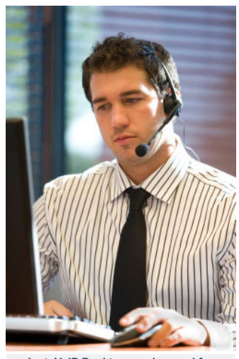
InstaVoIP Desktop can be used for Softphones or PC-based applications

InstaVoIP Desktop is an optimized library release for Windows and Linux, allowing for the rapid integration of voice calling features into new or existing applications without dealing with any porting or audio issues. Standalone SoftPhone application examples are provided, or the libraries can be integrated into existing applications.