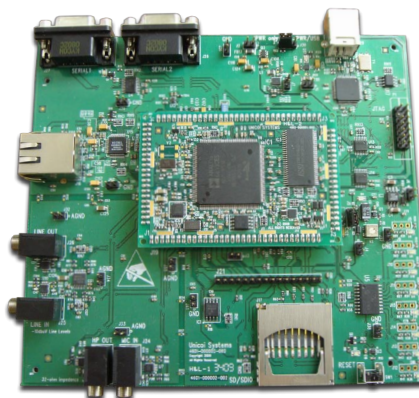
InstaVoIP Module Mounted on Development Kit Carrier Board

The InstaVoIP Module Development Kit consists of one InstaVoIP Module, one debug carrier board, USB cable (for power only), Ethernet cable and headset. The initial InstaVoIP Module Development Kit requires the VisualDSP++® Development Environment from Analog Devices.